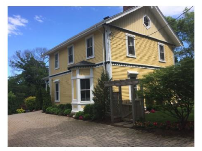
Charles Heath's home, built 1855