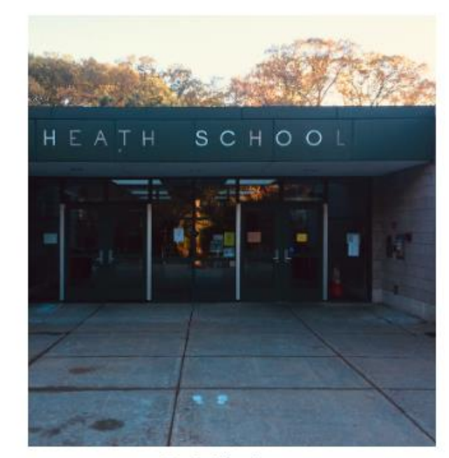
Heath School, 2020

In 1841, the Town chose Heath as the name for an existing road, stating that it "stretched from the Worcester turnpike or Boylston Street by Mr. Heath's to the Newton line." [4] In 1847, the school on that road changed its name from the "Middle District School" to the more specific "Middle District School on Heath Street". For a number of years, teachers boarded with the Heaths, who prized their companionship.[5] A few decades later, the school shortened its name to the Heath School, a name it continues to carry today, even in its new location on Eliot Street.